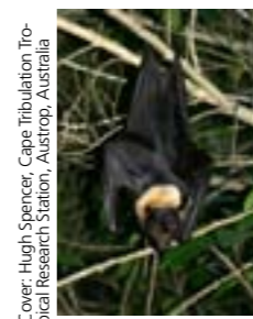
Cover: Hugh Spencer, Cape Tribulation Tropical Research Station, Austrop, Australia