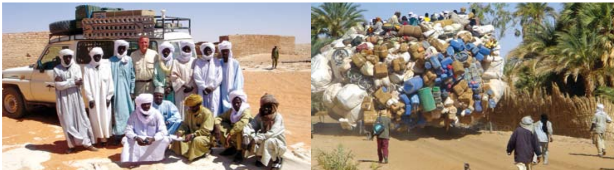
Gentle giant: The 5.5 square kilometre, saline Lake Teli at Ounianga Serir. The islands were once at least 50 metres below the water surface. Bottom left: The author with native dignitaries. Right: An overloaded lorry reaches the researchers' quarters following an odyssey through the Sahara.

up to 80 metres above today's lake-beds. Based on radiocarbon dating, the finely laminated diatomaceous muds and mollusc-bearing chinks are early Holocene, i.e. 7,000 to 10,000 years old. The individual sediment sequences shall later be correlated with the climate archive of Lake Yoa at Ounianga Kebir.