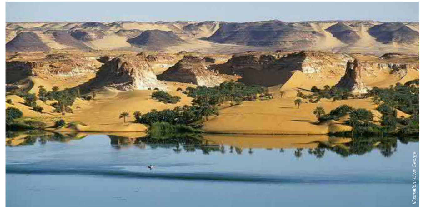
Illustration: Uwe George

Lake Yoa at Ounianga against the imposing backdrop of the Sahara: the first samples were taken in 1999 from a platform. There are currently 19 lakes at Ounianga, covering a total area of 15 square kilometres – the largest and most famous in the Sahara.