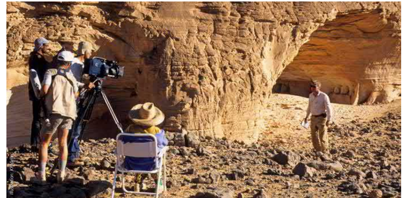
Broadcaster ARTE filming at Wadi Sura, at the foot of the Gilf Kebir plateau in Egypt with the “Cave of Swimmers” in the background.